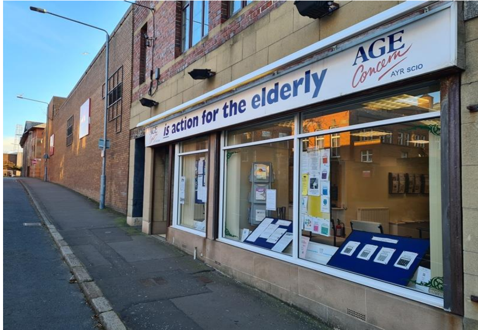
Our Information and Advice Centre

Age Concern Ayr SCIO operate an Information and Advice Centre at 6 Garden Street, Ayr with a focus on issues affecting South Ayrshire residents aged 55 and over. The Centre is fully funded by our shop, and we employ a part-time Administrator to support clients who need help or advice on a wide range of issues. We understand that completing forms can be confusing and that not all our clients are digitally aware, and so we help make the process simpler for them. We can help them to request and complete forms including applications for: