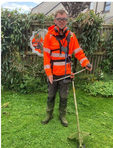
Our Grass Cutting Service

If you would like to find out more about this service, please contact our Advice and Information Centre.