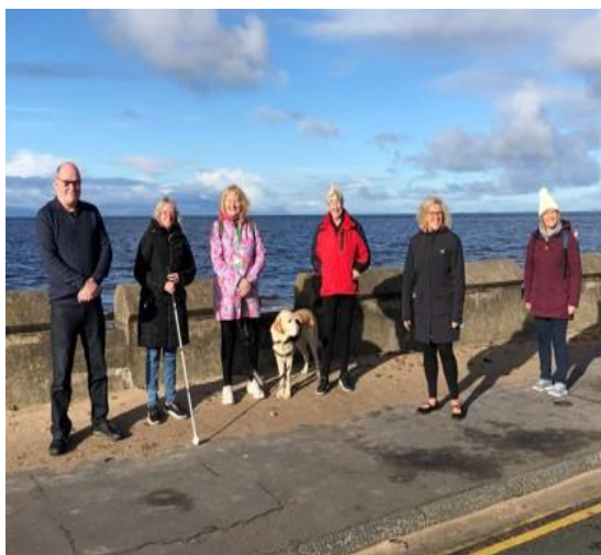
A SISS Wellbeing Walk

Age Concern Ayr were asked to support SISS who were trying to raise funding to enable their co-ordinator to run a monthly Visual Loss Support Group, a weekly Well Being Walk, and one-to-one support visits for those struggling with age related hearing and/or sight loss. The trustees agreed to donate £1,000 to this worthwhile charity. We subsequently increased this by £3,500 which will show in next year's accounts.