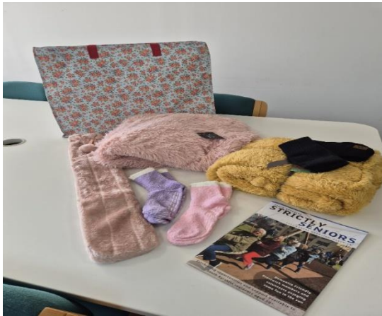
A Sample Cozy Bag

Age Concern Ayr donated £2,500 to VASA to fund the purchase of Cozy Bags which were distributed to vulnerable people struggling with heating costs. They contained a fluffy blanket, an 'oodie', a hat and gloves set, cosy socks, a hotwater bottle and a copy of the 'Strictly Seniors' magazine. They were much appreciated by those who received them.