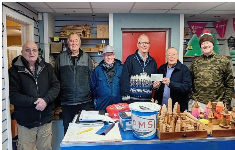
Our Chair Presenting the Cheque

In addition, in the last year, we donated £500 to the Ayr and Prestwick's Men's Shed (APMS), a new local charity which supports mental health and well-being.