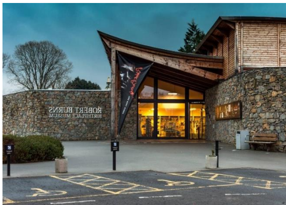
The Robert Burns Birthplace Museum

Age Concern Ayr worked with the National Trust Scotland to offer over 55s an opportunity to visit the museum for free and to enjoy a coffee and scone. Fifty people requested tickets although not all were used. The total cost of the project was £545.