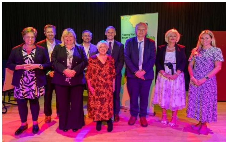
The Launch of The Ageing Well Strategy