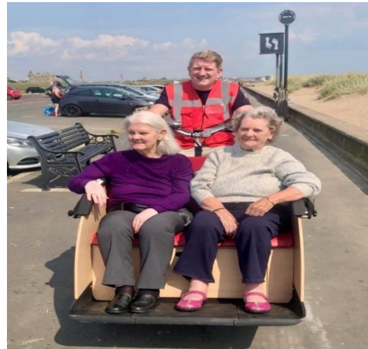
A Cycling Without Age Trip

Cycling Without Age is a not-for-profit organisation which provides trained volunteer cyclists who use special three wheelers. They enable people with mobility or disability issues to experience a bracing ride along the Ayr seafront. We donated £300 to help them set up this local initiative.