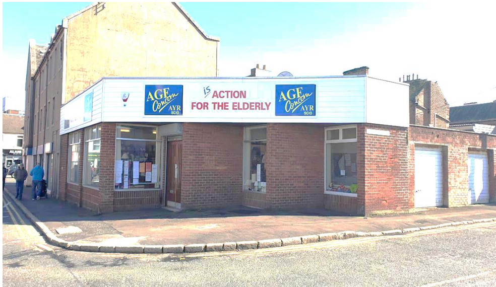
Our Age Concern Shop

Our Charity Shop is located at 5 Crown Street in Ayr and is run entirely by Age Concern Ayr SCIO's greatest resource - our team of dedicated volunteers.