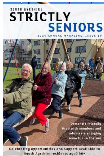
The Strictly Seniors Magazine