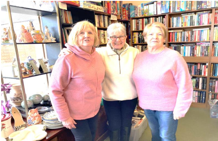
Members of Our Volunteer Team

Our work would not be possible without the support of our dedicated volunteers, and we are always keen to add to our Volunteer Team. Our volunteers gain experience and new skills in a retail environment whilst working as part of a friendly and supportive team and helping to support older people in our community.